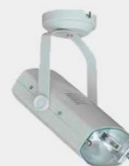
金卤灯 Floodlight 300W