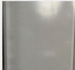
洞洞板 Hole hole plate 1000L x 2500Hmm