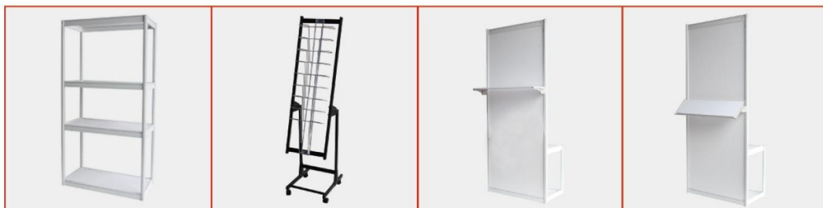
层板架 Shelf Rack 1000L x 500W x 2000Hmm