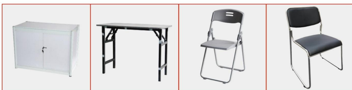
锁柜 Lockable cupboard 1000L x 500W x 750Hmm