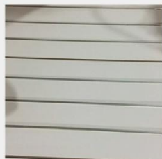
槽板 Trough plate 1000L x 2500Hmm