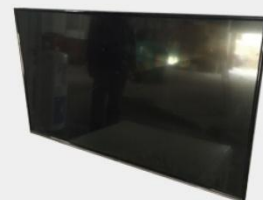
等离子显示器42寸 Plasma Displayer 42"plus a deposit