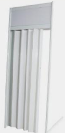
带锁折门 Folding door 1000L x 2000Hmm