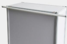
日光灯 Fluorescent Lamp 40W