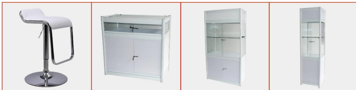
吧椅 Bar Stool 460L x 400D x 455SHmm